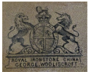
"Shame on him who thinks evil of it."