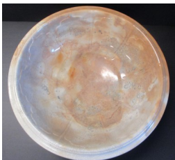
Interior of wash bowl

On display at the museum: Wash bowl, Royal Ironstone China, George Wooliscroft, England, 19 th century.