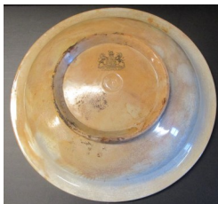
Bottom of wash bowl